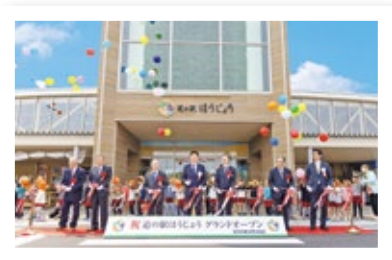
▲ Grand opening of Roadside Station Hōjō