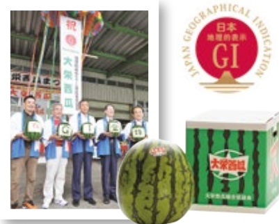
▲ Daiei Watermelon was registered as a Geographical Indication (GI) by the Ministry of Agriculture, Forestry and Fisheries.