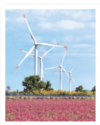
▲ The Hōjō Sand Dune Wind Farm began operation.