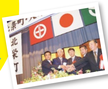
▲ The former Hōjō Town and the former Daiei Town merged.

Hokuei Town celebrates the 20th anniversary of the establishment of the municipal system. The footsteps of our predecessors from the past through the present and connecting to the future