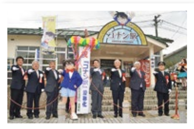
▲ JR Yura Station was nicknamed Conan Station.