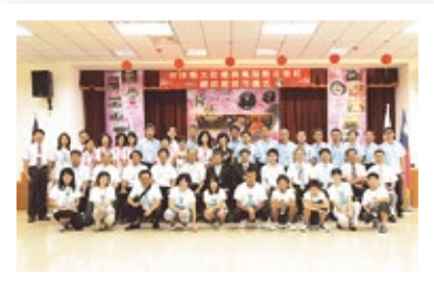
▲ Signed the Friendship Exchange Agreement with Dadu Township, Taichung County (present Dadu District, Taichung City), of the Republic of China.